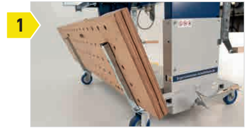
Rear supports for putting down the worktop.

THAT MAKE THE SUPPORTERS AM 500-FLEXX + AM 1200-FLEXX SPECIAL: