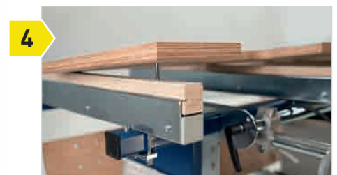
Worktop can be removed quickly and easily for individual purposes.