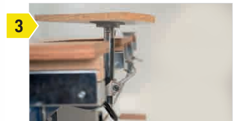
If necessary, the vacuum clamping unit can be folded away under the worktop.