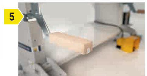
Vertical support adjustable left and right in a 50mm keyhole grid.