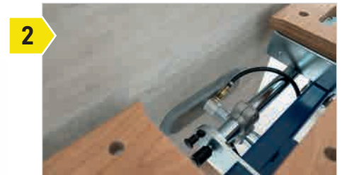
Vacuum clamping unit with two sliding oval grippers with touch valve.